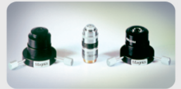
Darkfield attachment • Imm. DF Condenser with OBJ 100x having Iris Diaphragm • Dry. DF condenser