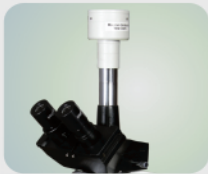
Micro Image Projection System MIPS fitted on MLX-Tr Plus (Trinocular version) MIPS can also be used with MLX-B Plus (Binocular version)