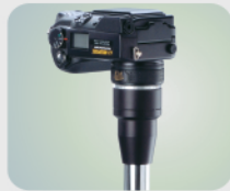
Digital Camera System fitted on MLX-Tr Plus (Trinocular version)